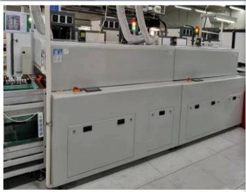
Coating Baking Glue Dispensing